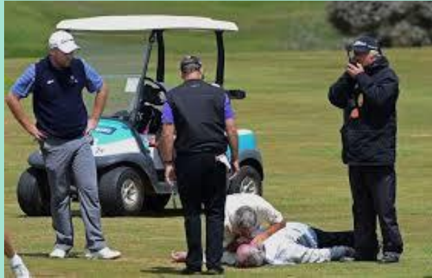
FIRST AIDERS LEVEL-1