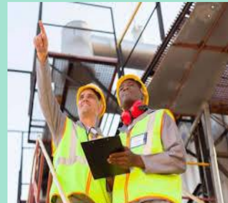
HEALTH & SAFETY REPRESENTATIVES